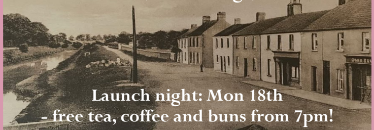
Photo Exhibition, Café Grange, Sallins