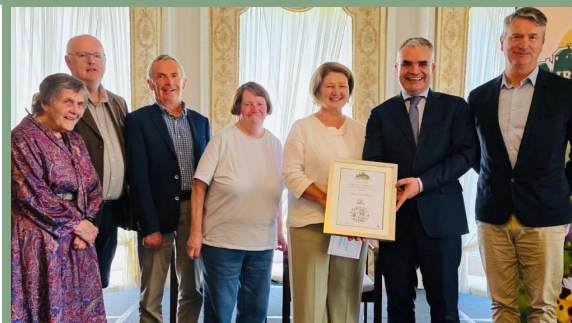
Members of Naas Tidy Towns receiving one of the awards in Farmleigh House.

These things don't just happen! Well done!! Proud week for Naas!