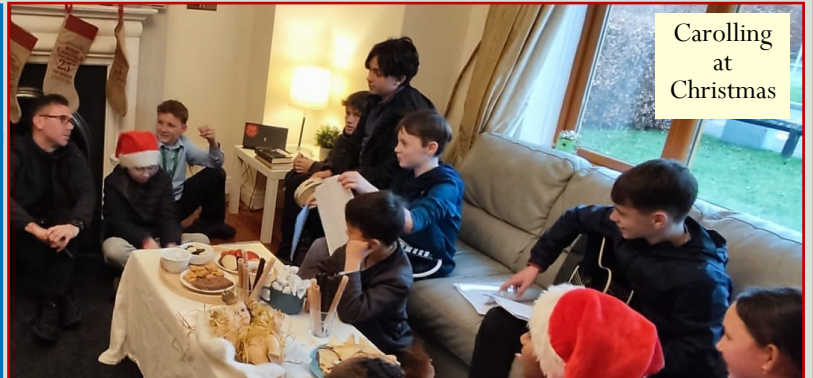
Carolling at Christmas