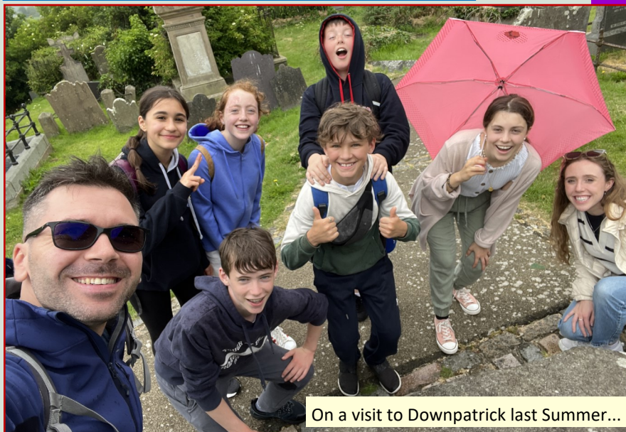
On a visit to Downpatrick last Summer...

This is a new club, starting on 16th Feb dedicated to the younger age groups where they can make new friends, have fun and discover that God is good to all of us.