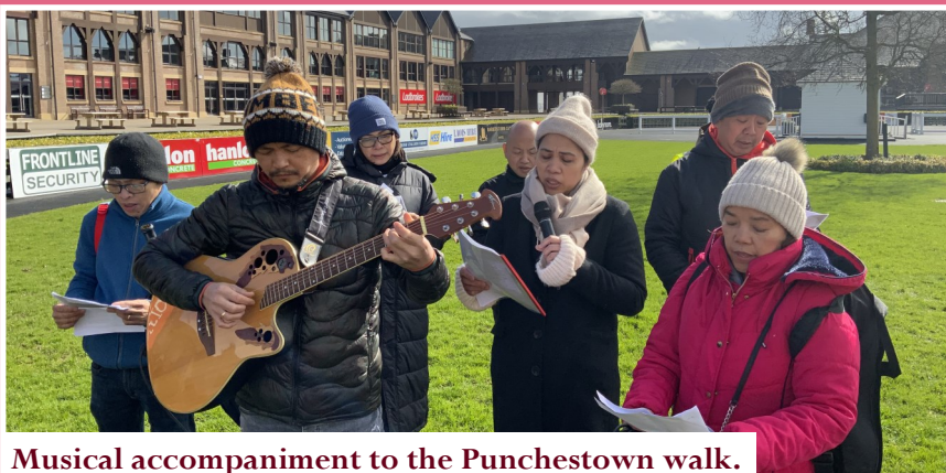
Musical accompaniment to the Punchestown walk.