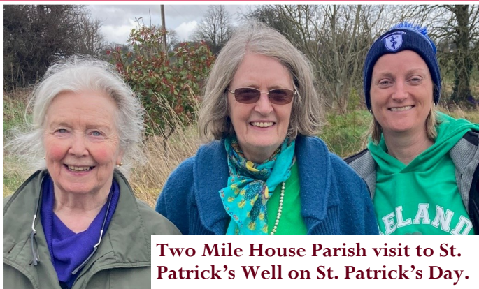
Two Mile House Parish visit to St. Patrick's Well on St. Patrick's Day.