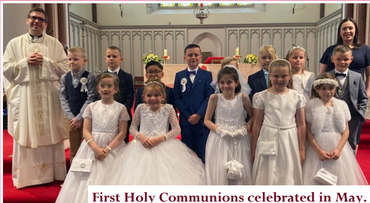
First Holy Communion celebrated in May.