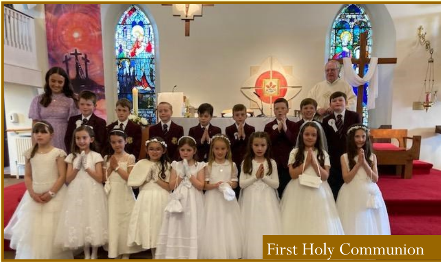
First Holy Communion