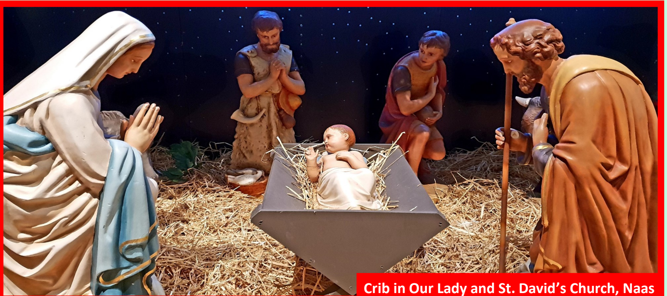
Crib in Our Lady and St. David's Church, Naas

On Christmas Day 1914, some German soldiers left their trenches and called out "Merry Christmas" in English across No Man's Land. The German troops were unarmed. The British Soldiers began to realise that it wasn't a trap and so dropped their arms. Both sides, we are told, shook hands, exchanged gifts of chocolate, cigarettes. Together, they sang Christmas Carols and in particular 'Silent Night'. Truly the spirit of Christmas was evident. How in the singing of that beautiful hymn the celebration of Christ's love managed to bring sworn enemies together, even for a period of time! Even beneath the pain and sadness of war the innate decency of humanity shone through. Not even a World War could destroy the true spirit of Christmas.