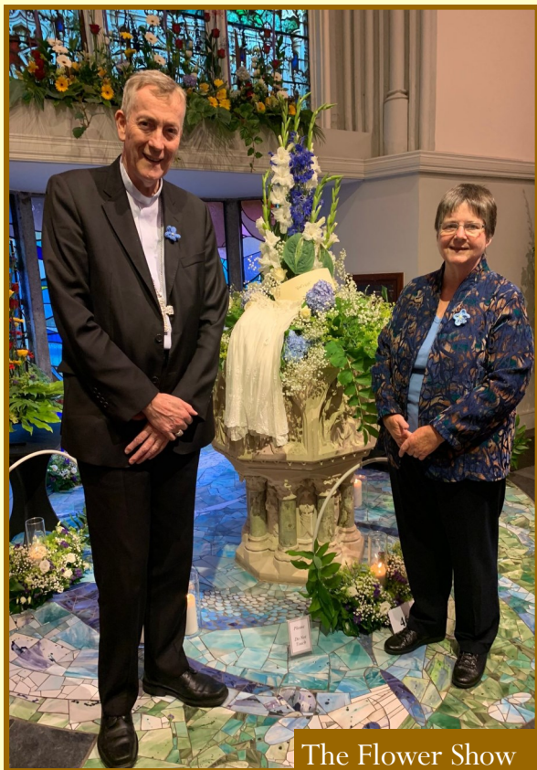
The Flower Show