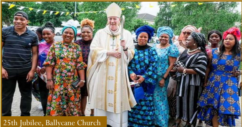
25th Jubilee, Ballycane Church