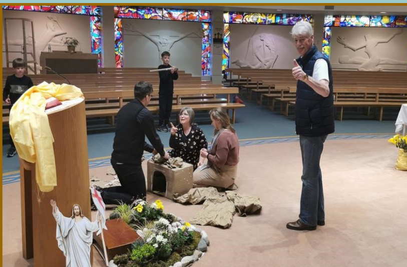
'Before and After': some of the Liturgy Group at work behind the scenes during Holy Week 2022.