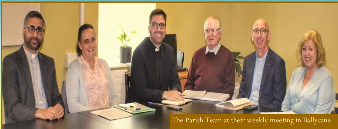
The Parish Team at their weekly meeting in Ballycane.