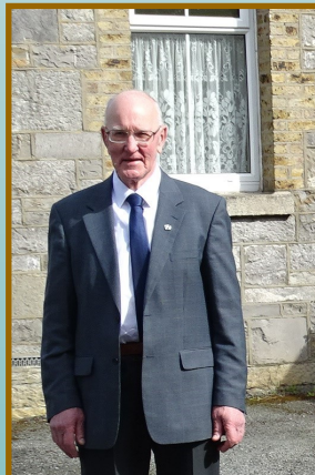
Remembering the c