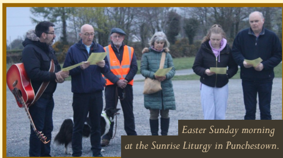
Easter Sunday morning at the Sunrise Liturgy in Punchestown.