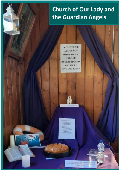
Church of Our Lady and the Guardian Angels