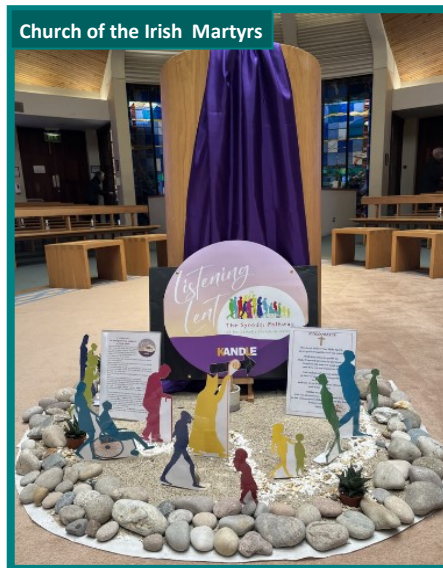
Church of the Irish Martyrs