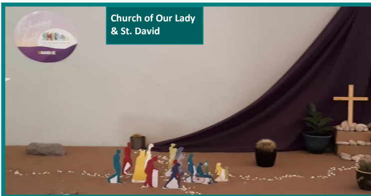
Church of Our Lady & St. David

Thank you to the Liturgy Groups for creating beautiful sacred spaces for Lent in all four of our Churches.