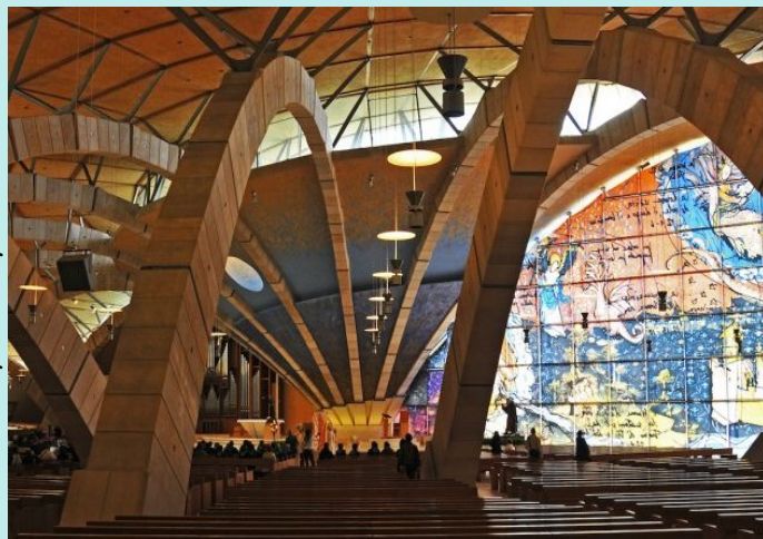
Beautiful interior of the Padre Pio Pilgrimage Church in the Italian town of San Giovanni Rotondo

He died on 23 September 1968 in San Giovanni Rotondo, Foggia, Italy of natural causes.