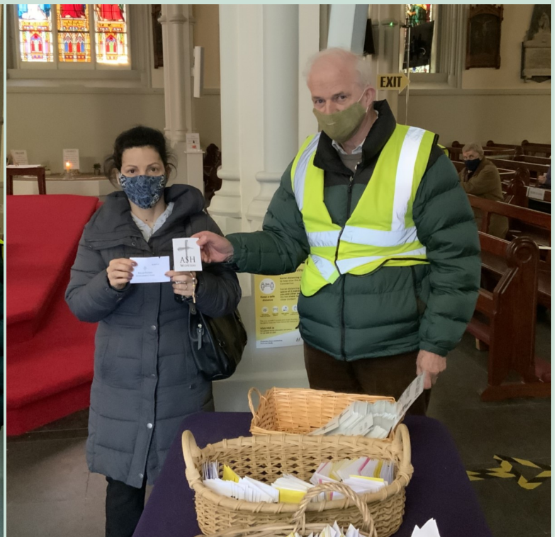
Ash Wednesday 2021: Parishioners collecting their Blessed Ashes and Ash Wednesday Prayer Card in the Church of Our Lady and St David, Naas. Sincere thanks to all our volunteers including the JPPII volunteers who helped fill the envelopes!