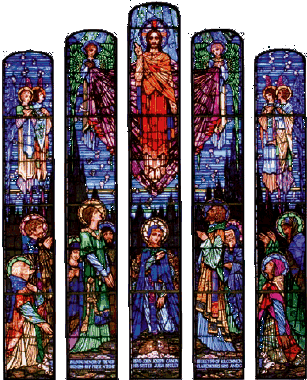
Detail from The Ascension 1926 by Harry Clarke - Church of the Immaculate Conception, Roundfort

Pastoral Pack for Sunday of the Ascension Sunday 24 th - Saturday 30 th May 2020