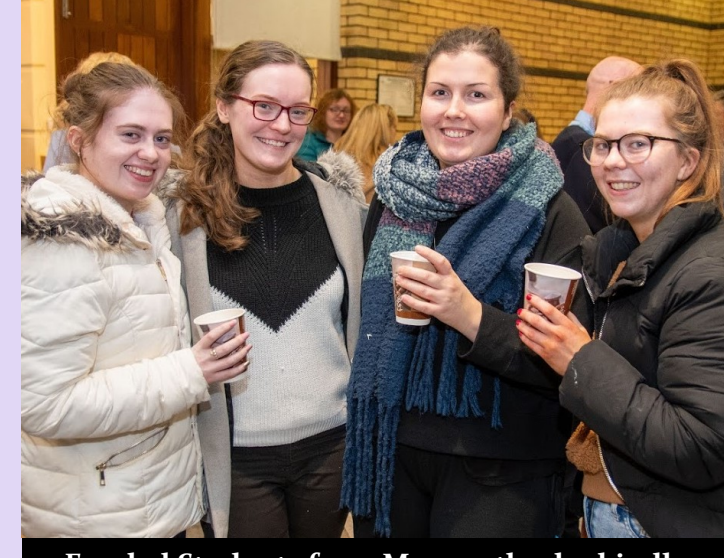
Froebel Students from Maynooth who kindly assisted with the Programme.