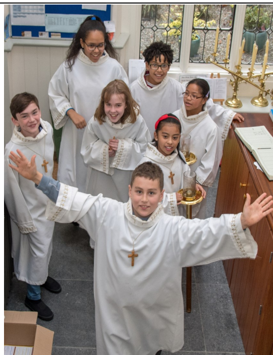
All set for the Novena!

A sincere thank you to all who attended and participated in the Novena, to the many stewards, both inside and outside the Church who offered a great welcome and hospitality to all attending. To all who participated so generously in various Ministries, Collectors, Readers, Eucharistic Ministers, Servers, PPC's, Sacristans, & Choirs. Míle Buíochas.