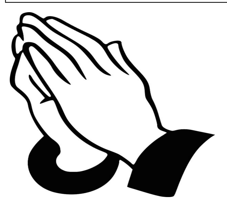
"Repent - Reflect - Pray"

During Lent we are called on to "repent- reflect- pray" and we make a special effort at this time to try to do all of these things. But when we pray we often do so only when we need something urgently and we do it in a hurry and often times make our prayers a "demand". We talk and talk to God. Do we pause to listen at all? Very often we don't.