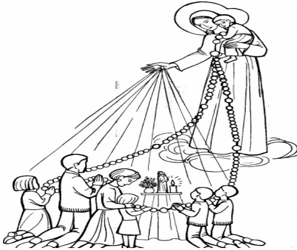
MAY - THE MONTH OF MARY

Traditionally, May is Mary's month, a time set aside for particular devotion to the Mother of Jesus. It is an opportunity for us to think a little more about Mary, about her role in the Church, and what she has to say to us Christians.